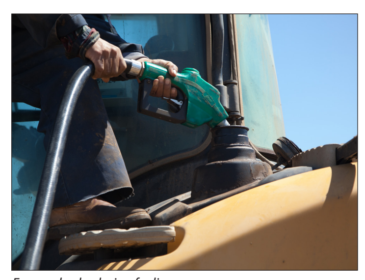
Engage brake during fueling.