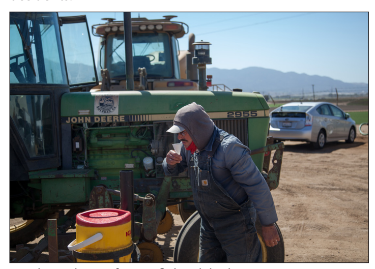
Drinking plenty of water fights dehydration.

Following safe operating procedure, rules and practices is important for preventing tractor accidents. Your knowledge and experience will also help. It is important to use good judgment when operating a tractor. Both you and the company share the responsibility for preventing accidents.