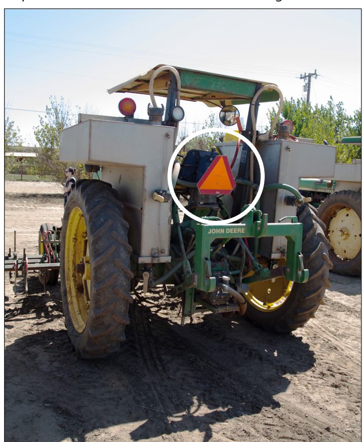
Tractor above is displaying the SMV emblem.

Make sure your tractor has the correct signs and devices when traveling on public roadways. These may include signs like the "Slow Moving Vehicle" (SMV) emblem. See Department of Motor Vehicles code to the right.