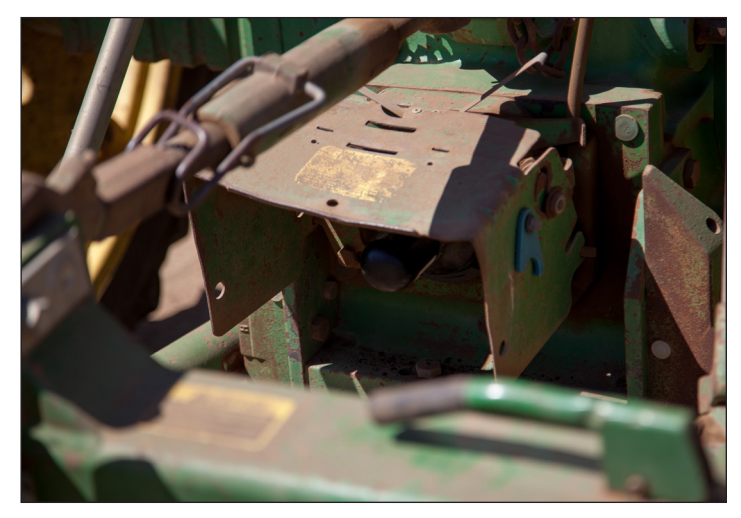
PTO is covered when not being used.

Inadequately guarded PTO (s) can entangle you, causing serious injuries. Avoid wearing loose clothing and accessories. Secure long hair before working near any machinery.