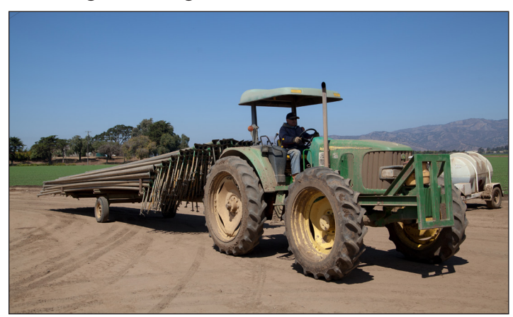
This tractor is pulling a load it can handle safely.

Pulling loads that are too heavy or not recommended can cause tractor upsets or affect the operating controls such as braking or steering.