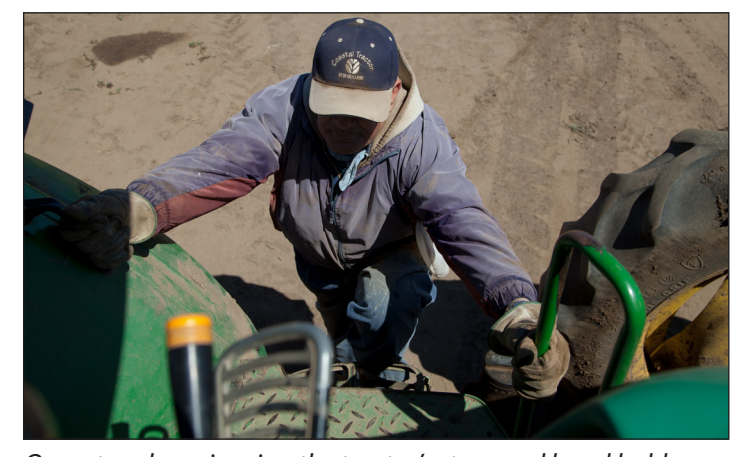
Operator above is using the tractor's steps and hand holds.

Climb onto your tractor carefully, always using the three points of contact rule. Use all the mounting points. Make sure your foot surface is slip resistant and stepping surface is clear of mud or other debris. Slipping and falling can be very dangerous, especially if you fall onto something sharp or hot.