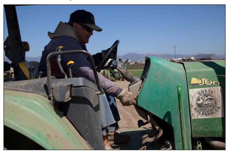
Driver is seated before starting engine.

Because exhaust gases contain carbon monoxide and other contaminants which can seriously hurt or kill you, avoid starting and running your tractor in enclosed areas or where there is poor ventilation.