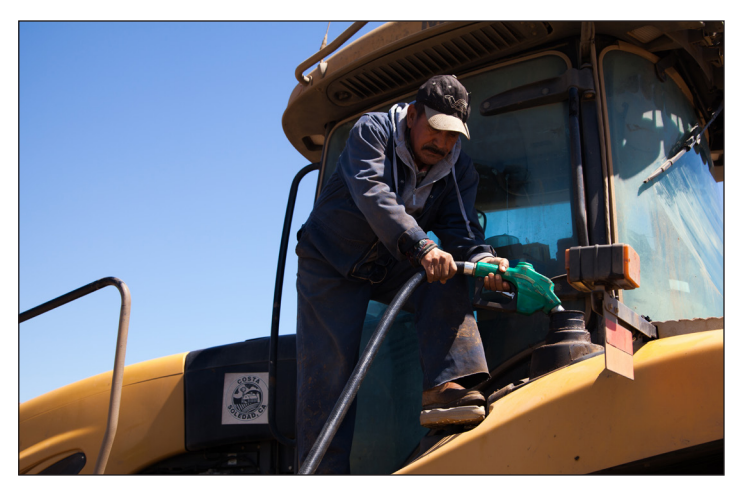
Make sure engine is cool and turned off.

To help avoid fire or explosion hazards, do not fill your fuel tank while the engine is hot, running or smoking. Keep fuels away from ignition sources.