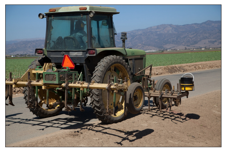
Driver is obeying applicable traffic laws

When on public roads, obey applicable traffic laws. Many serious accidents involve collisions between tractors and normal passenger vehicles. Be especially careful when making left-hand turns. Lock brake pedals together.