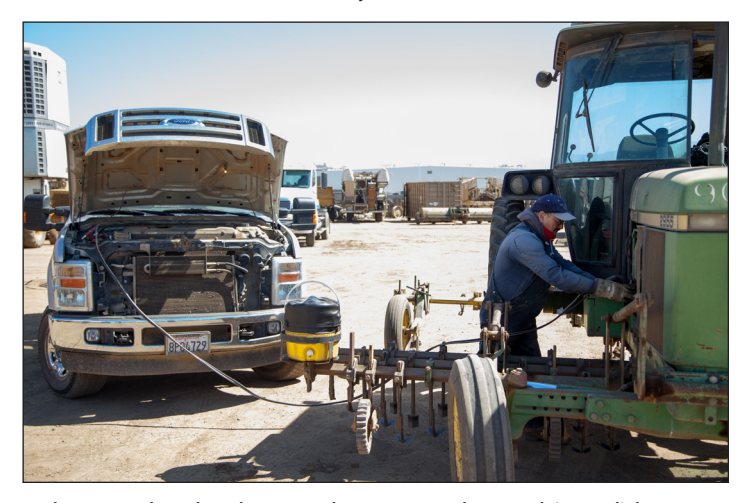
White truck in background contains charged (good) battery.